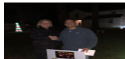
Holiday Lights December